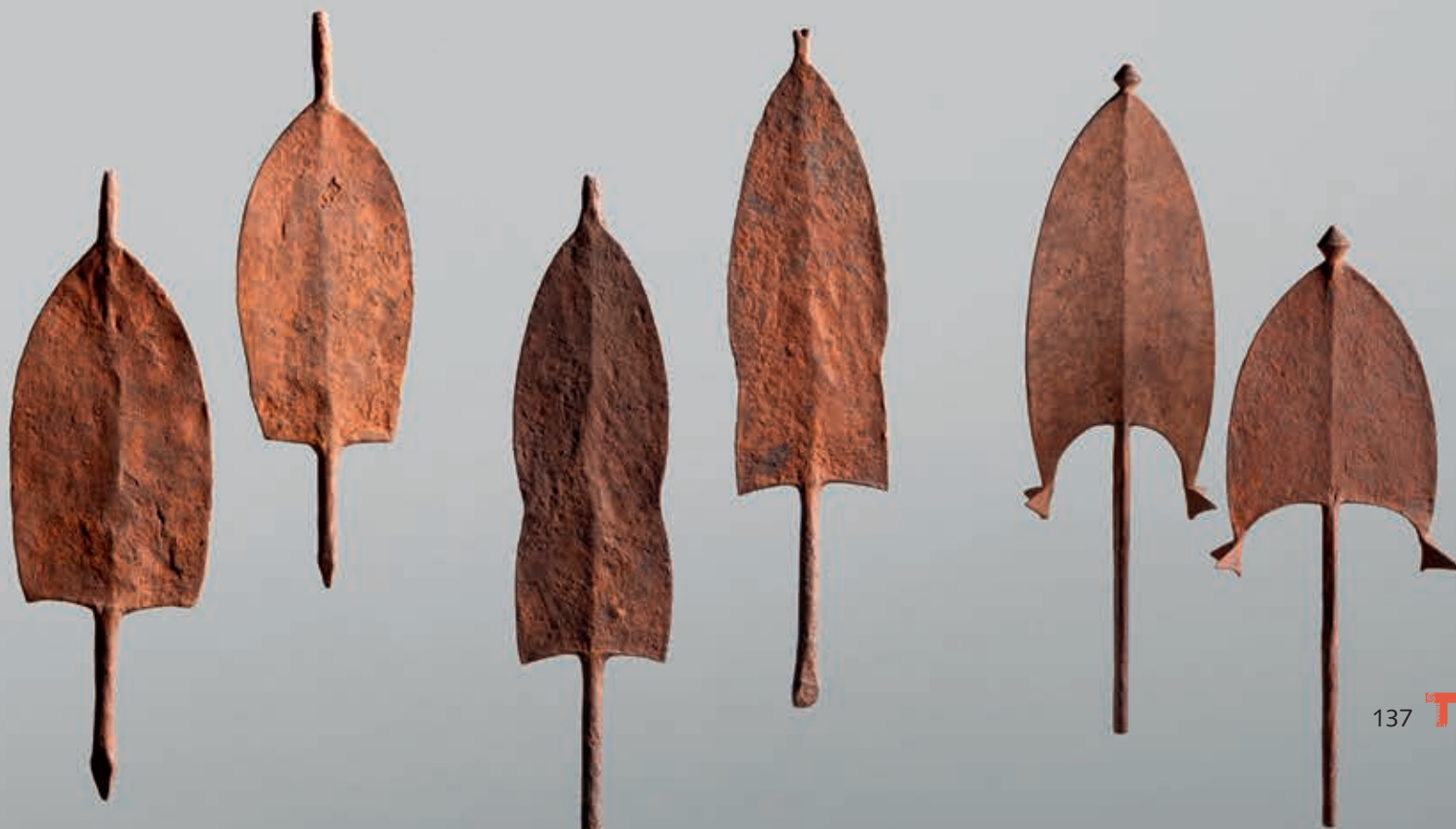
FIG. 13a–f (below): Form variation of spear blade currencies, mbili . Ngbaka, DR Congo. Forged iron. Height of tallest: 55 cm.