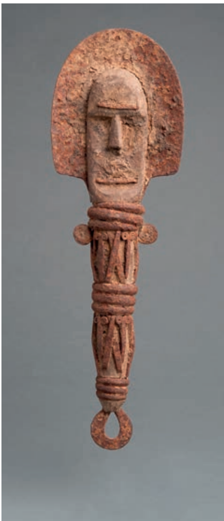
FIG. 19 (below): Hammer/anvil. Mambila/Mfumte, Cameroon. Forged iron. H: 41 cm.