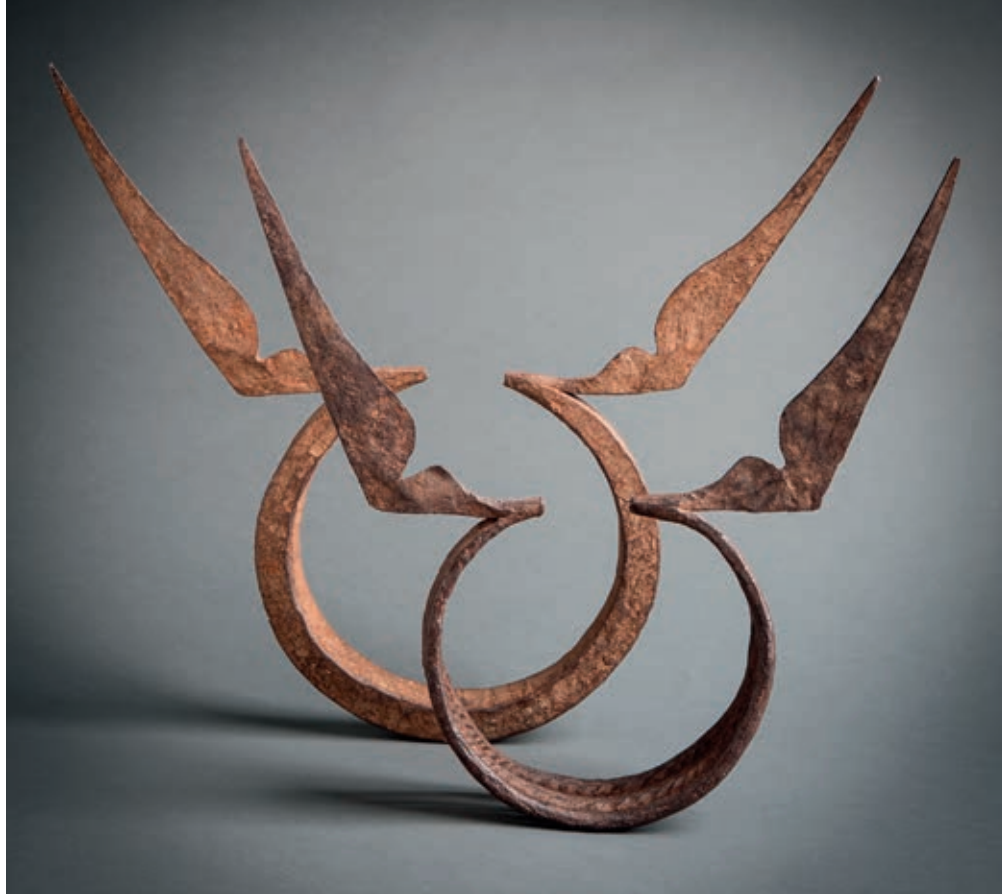
FIG. 17 (above): Torques. Mumuye/Chamba (?), Nigeria/Cameroon. Forged iron. Width of widest: 42 cm.

Musée du quai Branly – Jacques Chirac Paris quai Branly.fr