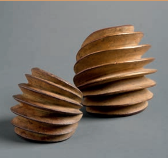
FIG. 16 (above): Anklets, djokelebale . Kota/Fang, Gabon. Forged copper alloy. Height of largest: 20 cm.